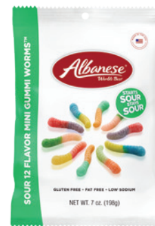
SOUR 12 FLAVOR MINI GUMMI WORMS™ ITEM #53356 12/7 oz. (198g)