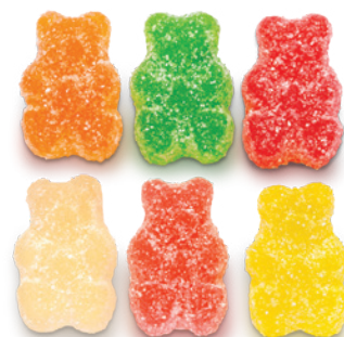
SOUR GUMMI BEARS (Cherry, Strawberry, Green Apple, Pineapple, Lemon & Orange) SUPER SOUR! ITEM #50117 4/4.5 LB. Approx. 130 Pieces Per LB.