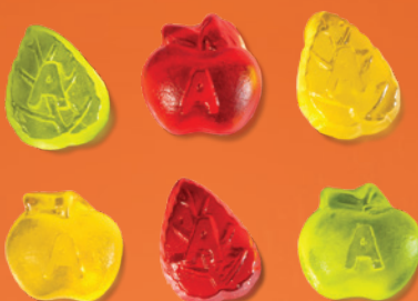
APPLE ORCHARD GUMMIES (McIntosh, Red Delicious, & Granny Smith Apple)