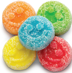
SOUR GUMMI POPPERS™ (Blue Raspberry, Lemon, Orange, Cherry & Green Apple) SUPER SOUR! ITEM #50126 4/4.5 LB. Approx. 164 Pieces Per LB.