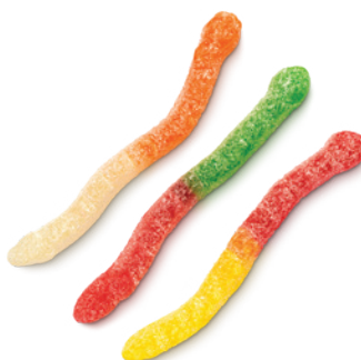
LARGE SOUR ASSORTED FRUIT GUMMI WORMS (Cherry, Green Apple, Pineapple, Lemon & Orange) SUPER SOUR! ITEM #50118 4/4.5 LB. Approx. 38 Pieces Per LB.