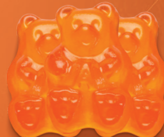
ORANGE GUMMI BEARS