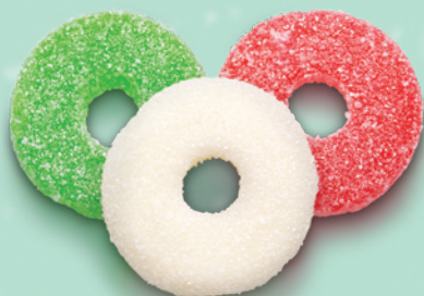
CHRISTMAS GUMMI WREATHS (Cherry, Green Apple & Strawberry-Banana)

ITEM #50506 4/5 LB. Approx. 130 Pieces Per LB.