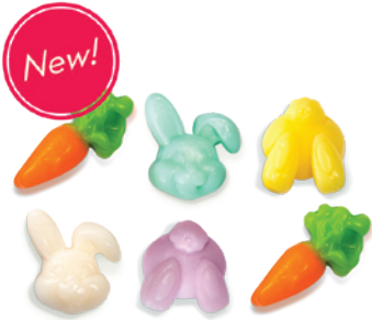
COTTONTAIL GUMMIES (Grape, Blue Raspberry, Pineapple, Mango & Orange)