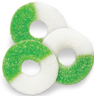
GUMMI APPLE RINGS MEDIUM SOUR ITEM #50128 4/4.5 LB. Approx. 65 Pieces Per LB.