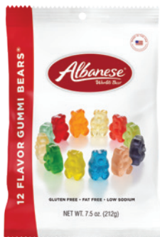
12 FLAVOR GUMMI BEARS™ ITEM #53348 12/7.5 oz. (212g)