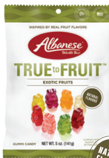
TRUE TO FRUIT™ EXOTIC FRUITS ITEM #53508 12/5 oz. (141g)