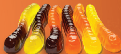
FALL MINI GUMMI WORMS (Lemon, Orange & Black Cherry)