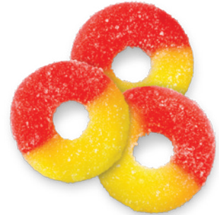
GUMMI STRAWBERRY-BANANA RINGS SWEET SANDED ITEM #50130 4/4.5 LB. Approx. 65 Pieces Per LB.