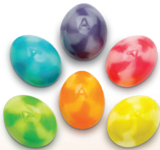
EGGSTRAVAGANT GUMMIES (Grape, Mango, Green Apple, Orange, Blue Raspberry & Cherry)

SWEET SANDED ITEM #50185 4/4.5 LB. Approx. 106 Pieces Per LB.