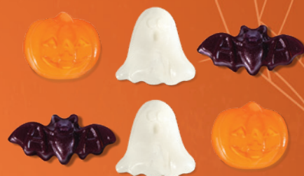
GHOULISH GUMMIES (Strawberry-Banana, Black Cherry & Orange)