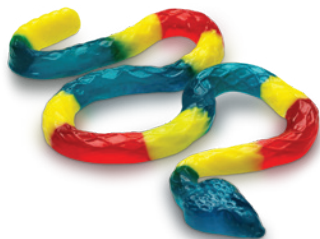
GIANT GUMMI RATTLESNAKE (Cherry, Blue Raspberry & Sour Lemon)

ITEM #50172 4/5 LB. Approx. 34 Pieces Per LB.