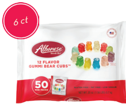
EVERYDAY 50 CT. MULTIPACK 6 CT. CASE ITEM #53443 50 Mini Packs inside each 25 oz. bag!