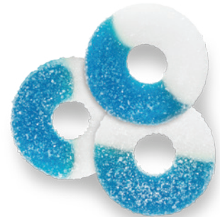
GUMMI BLUE RASPBERRY RINGS MEDIUM SOUR ITEM #50131 4/4.5 LB. Approx. 65 Pieces Per LB.