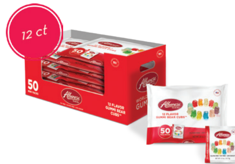
EVERYDAY 50 CT. MULTIPACK 12 CT. DRC ITEM #53440 50 Mini Packs inside each 25 oz. bag!