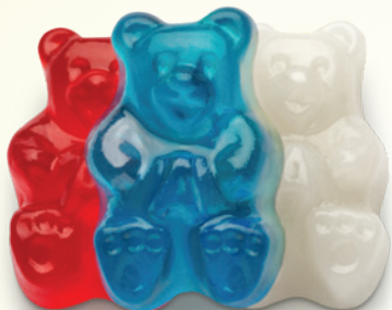
FREEDOM GUMMI BEARS (Blue Raspberry, Cherry & Strawberry-Banana)

MEDIUM SOUR ITEM #50135 4/4.5 LB. Approx. 65 Pieces Per LB.