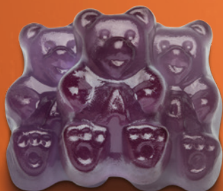
GRAPE GUMMI BEARS