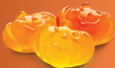
FALL GUMMI PUMPKINS (Cherry, Orange & Lemon)