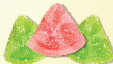
GUMMI WATERMELON SLICES (Watermelon)

ITEM #50160 4/5 LB. Approx. 43 Pieces Per LB.