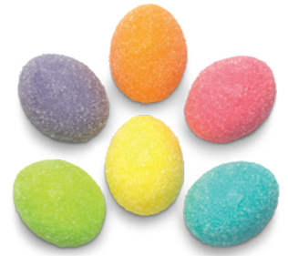
EGGSTRA SPECIAL GUMMIES (Lemon, Green Apple, Blue Raspberry, Grape, Orange & Strawberry)

ITEM #50150 4/5 LB. Approx. 130 Pieces Per LB.