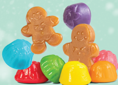
JOLLY GINGERBREAD GUMMIES (Fresh Spin on Cherry, Strawberry, Lemon, Orange, Blue Raspberry, Green Apple & Grape)