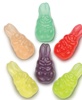
GUMMI ALBUNNIES™ (Mango, Strawberry, Blue Raspberry, Green Apple, Cherry & Grape)

ITEM #50151 4/4.5 LB. Approx. 130 Pieces Per LB.