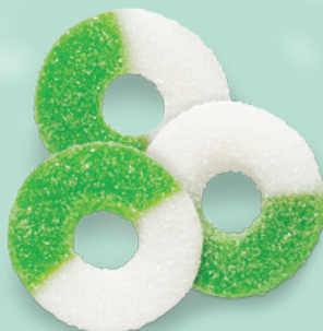
GUMMI APPLE RINGS MEDIUM SOUR

MEDIUM SOUR ITEM #50503 4/5 LB. Approx. 65 Pieces Per LB.