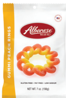
GUMMI PEACH RINGS ITEM #53349 12/7 oz. (198g)