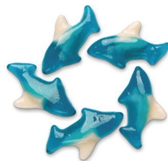
BLUE GUMMI SHARKS FIRECRACKER POPSICLE FLAVOR (Cherry, Lemon-Lime & Blue Raspberry)

ITEM #50231 20 LB. Approx. 5 Pieces Per LB. Size of Rattlesnake: 27" L