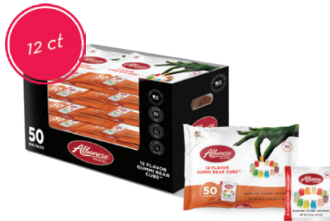
HALLOWEEN TRICK OR TREAT 50 CT. BAGS - 12 CT. DRC CASE ITEM #53441 50 Mini Packs inside each 25 oz. bag! *Offered Seasonally Only