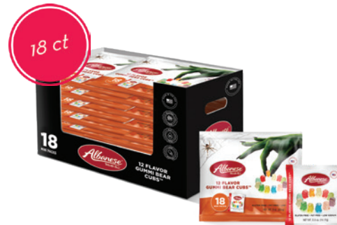
HALLOWEEN TRICK OR TREAT 18 CT. BAGS - 18 CT. DRC CASE ITEM #53445 18 Mini packs inside each 9 oz. bag! *Offered Seasonally Only