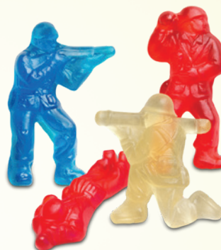
GUMMI MILITARY HEROES (Blue Raspberry, Cherry & Pineapple)

ITEM #50138 4/5 LB. Approx. 130 Pieces Per LB.