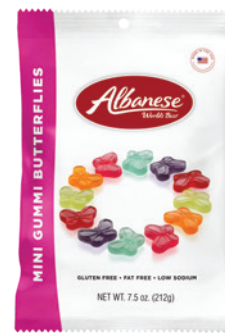
MINI GUMMI BUTTERFLIES ITEM #53352 12/7.5 oz. (212g)