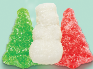
GUMMI SNOWMEN & TREES WITH SNOW (Cherry, Green Apple & Strawberry-Banana)

ITEM #50504 4/5 LB. Approx. 75 Pieces Per LB.