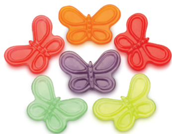
LARGE GUMMI BUTTERFLIES (Grape, Strawberry, Orange, Blue Raspberry, Cherry & Green Apple)

ITEM #50193 4/5 LB. Approx. 70 Pieces Per LB. Size of Shark: 1.75" L x 1.125" H