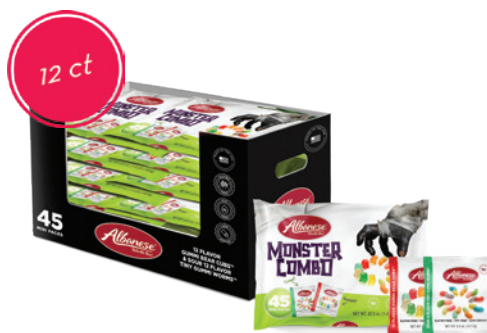
SWEET & SOUR COMBO 45 CT. BAGS - 12 CT. DRC CASE ITEM #53552 45 Mini packs inside each 22.5 oz. bag! *Offered Seasonally Only