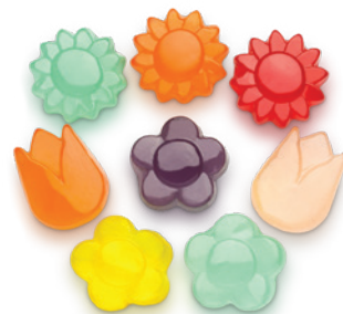
GUMMI AWESOME BLOSSOMS (Cherry, Blue Raspberry, Strawberry, Grape, Mango & Orange)

ITEM #50234 4/5 LB. Approx. 150 Pieces Per LB.