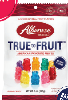
TRUE TO FRUIT™ AMERICAN FAVORITE FRUITS ITEM #53572 12/5 oz. (141g)