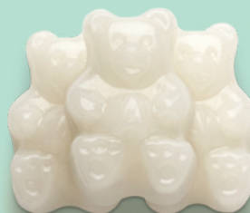
WHITE STRAWBERRY-BANANA GUMMI BEARS

MEDIUM SOUR ITEM #50505 4/4.5 LB. Approx. 75 Pieces Per LB.