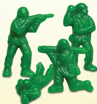
GUMMI ARMY GUYS (Green Apple)

ITEM #50230 4/5 LB. Approx. 57 Pieces Per LB.