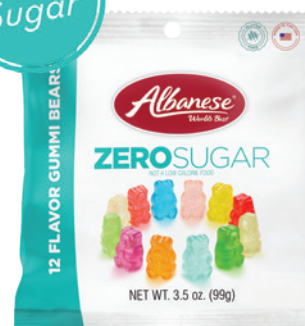
ZERO SUGAR 12 FLAVOR GUMMI BEARS™ ITEM #53354 12/3.5 oz. (99g)