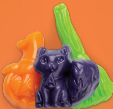
SPOOKTACULAR GUMMI MIX (Orange, Grape & Green Apple)