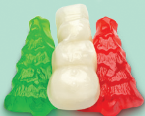
GUMMI SNOWMEN & TREES (Cherry, Green Apple & Strawberry-Banana)

ITEM #50131 4/4.5 LB. Approx. 65 Pieces Per LB. *Available Year Round