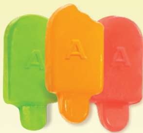
SHERBET GUMMI ICE POPS (Orange, Lime & Strawberry)

ITEM #50454 4/5 LB. Approx. 130 Pieces Per LB.