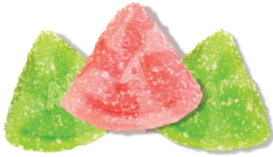
GUMMI WATERMELON SLICES (Watermelon) MEDIUM SOUR ITEM #50456 4/4.5 LB. Approx. 130 Pieces Per LB.