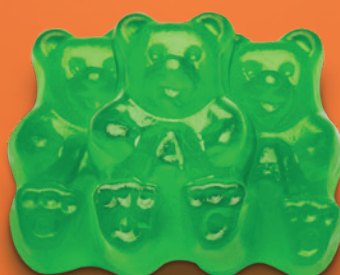
GREEN APPLE GUMMI BEARS