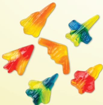
GUMMI JET FIGHTERS (Lemon, Orange, Cherry & Blue Raspberry)

ITEM #50171 4/5 LB. Approx. 43 Pieces Per LB.