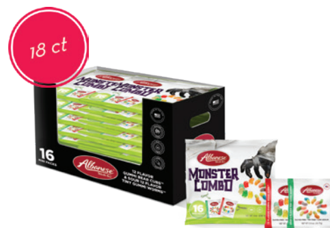
SWEET & SOUR COMBO 16 CT. BAGS - 18 CT. DRC CASE ITEM #53553 16 Mini packs inside each 8 oz. bag! *Offered Seasonally Only