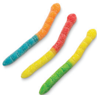
SOUR LARGE NEON GUMMI WORMS (Blue Raspberry, Lemon, Orange, Cherry & Green Apple) SUPER SOUR! ITEM #50104 4/4.5 LB. Approx. 38 Pieces Per LB.