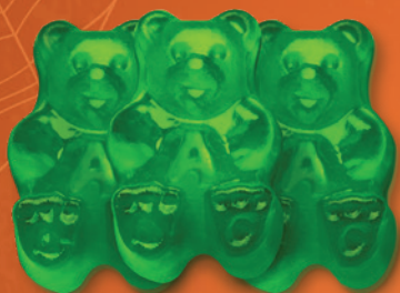
APPLE CRISP GUMMI BEARS (Apple Cinnamon)