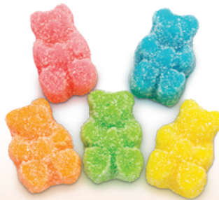
GUMMI BEEP BEARS™ (Strawberry, Blue Raspberry, Orange, Green Apple & Lemon)

ITEM #50184 4/5 LB. Approx. 106 Pieces Per LB.