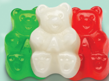
CHRISTMAS GUMMI BEARS (Cherry, Green Apple & Strawberry-Banana)

ITEM #50509 4/5 LB. Approx. 76 Pieces Per LB.