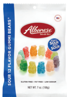
SOUR 12 FLAVOR GUMMI BEARS™ ITEM #53328 12/7 oz. (198g)