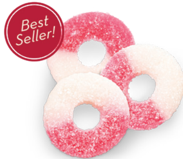
GUMMI WATERMELON RINGS MEDIUM SOUR ITEM #50134 4/4.5 LB. Approx. 65 Pieces Per LB.