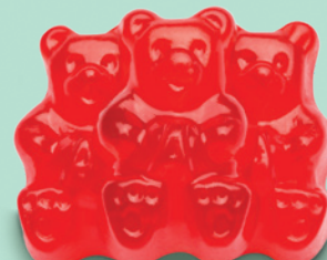
WILD CHERRY GUMMI BEARS

ITEM #50180 4/5 LB. Approx. 130 Pieces Per LB. *Available Year Round