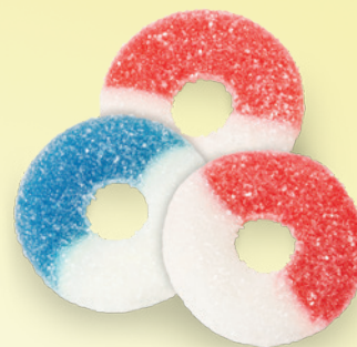
GUMMI FREEDOM RINGS (Blue Raspberry & Cherry)

ITEM #50455 4/5 LB. Approx. 130 Pieces Per LB.