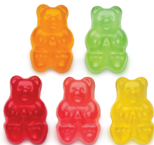
5 NATURAL FLAVOR GUMMI BEARS™ (Lemon, Orange, Cherry, Green Apple & Watermelon)

ITEM #50270 4/5 LB. Approx. 130 Pieces Per LB.