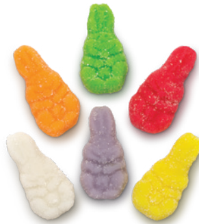
SANDED GUMMI ALBUNNIES™ (Orange, Lemon, Grape, Green Apple, Cherry & Strawberry-Banana)