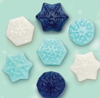
GUMMI SNOW FLURRIES (Pineapple, Watermelon & Blue Raspberry)

ITEM #50509 4/5 LB. Approx. 76 Pieces Per LB.