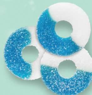
GUMMI BLUE RASPBERRY RINGS MEDIUM SOUR

ITEM #50128 4/4.5 LB. Approx. 65 Pieces Per LB. *Available Year Round