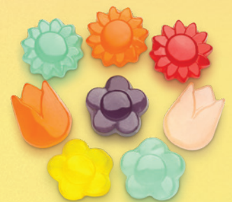
GUMMI AWESOME BLOSSOMS* (Cherry, Blue Raspberry, Strawberry, Grape, Mango & Orange)

ITEM #50162 4/5 LB. Approx. 65 Pieces Per LB. *Available Year Round