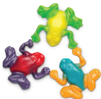
GUMMI RAINFOREST FROGS (Blue Raspberry/Orange, Strawberry/Grape & Sour Lemon/Sour Green Apple)

ITEM #50172 4/5 LB. Approx. 34 Pieces Per LB.