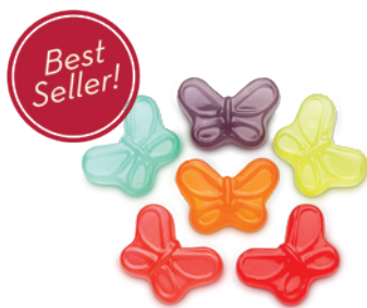
MINI GUMMI BUTTERFLIES (Grape, Strawberry, Orange, Blue Raspberry, Cherry & Green Apple)

ITEM #50233 4/5 LB. Approx. 27 Pieces Per LB.