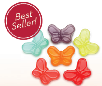
MINI GUMMI BUTTERFLIES* (Grape, Strawberry, Orange, Blue Raspberry, Cherry & Green Apple)

ITEM #50233 4/5 LB. Approx. 27 Pieces Per LB. *Available Year Round