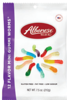
12 FLAVOR MINI GUMMI WORMS™ ITEM #53350 12/7.5 oz. (212g)